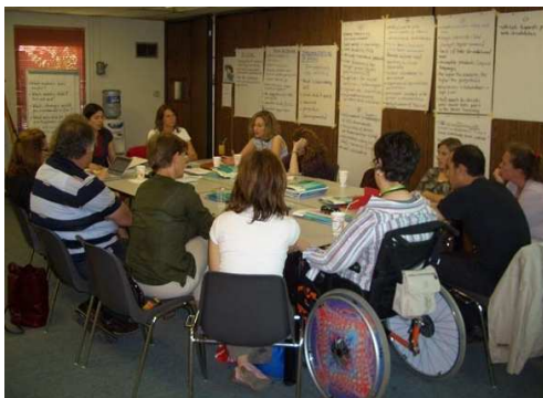
Athen, June 2007