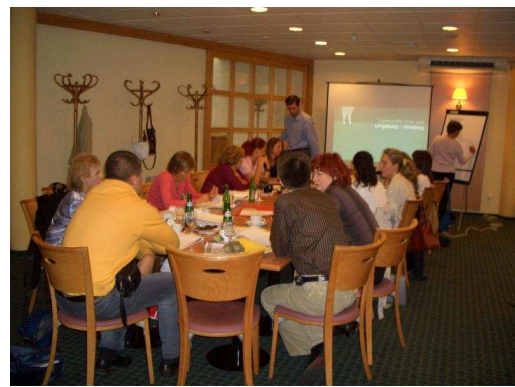
Budapest, September 2006