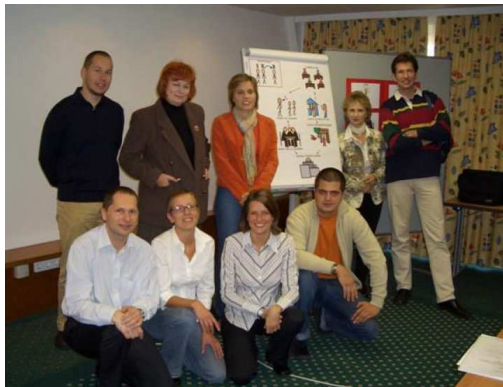
Graz, October 2005