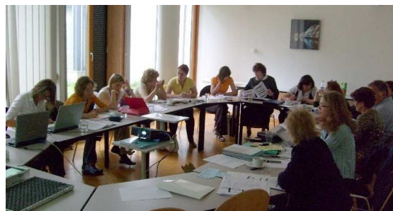
Gelsenkirchen, May 2008