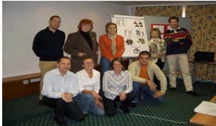
Das europäische BASKI Team

This project is carried out with the support of the European Community in the framework of the Socrates program